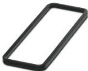
Profile gasket for HEAVYCON EVO supporting base element type B24, conductive

Please be informed that the data shown in this PDF Document is generated from our Online Catalog. Please find the complete data in the user's documentation. Our General Terms of Use for Downloads are valid ( http://phoenixcontact.com/download )