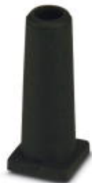
Bend protection sleeve, color: black

Please be informed that the data shown in this PDF Document is generated from our Online Catalog. Please find the complete data in the user's documentation. Our General Terms of Use for Downloads are valid ( http://phoenixcontact.com/download )