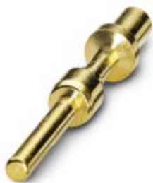
Crimp contact, turned, Single contact, contact diameter: 3.6 mm, crimp range: 1 mm 2 ... 2.5 mm 2

Please be informed that the data shown in this PDF Document is generated from our Online Catalog. Please find the complete data in the user's documentation. Our General Terms of Use for Downloads are valid ( http://phoenixcontact.com/download )