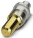
D-SUB power contact, connection method: Lötstift

D-SUB power contact - CUC-DSC-C1MAU-S/DSL5:100 - 1426073