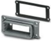
D-SUB panel mounting frame, shell size 2, IP67 degree of protection

D-SUB panel mounting frames - VS-15-A - 1688036