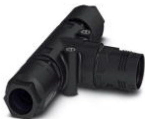
QUICKON T-distributor, black, 4+PE-pos., 2.5 mm 2 ... 6.0 mm 2 /690 V/40 A, for cable diameter of 12 mm ... 20 mm, with two QUICKON nuts

Please be informed that the data shown in this PDF Document is generated from our Online Catalog. Please find the complete data in the user's documentation. Our General Terms of Use for Downloads are valid ( http://phoenixcontact.com/download )