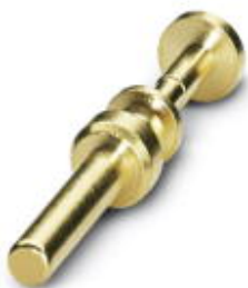
Crimp contact, turned, Single contact, contact diameter: 3.6 mm, crimp range: 4 mm 2 ... 6 mm 2

Please be informed that the data shown in this PDF Document is generated from our Online Catalog. Please find the complete data in the user's documentation. Our General Terms of Use for Downloads are valid ( http://phoenixcontact.com/download )