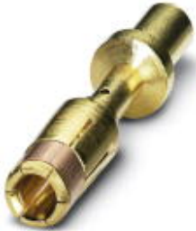
Crimp contact, turned, Single contact, contact diameter: 3.6 mm, crimp range: 1 mm 2 ... 2.5 mm 2

Please be informed that the data shown in this PDF Document is generated from our Online Catalog. Please find the complete data in the user's documentation. Our General Terms of Use for Downloads are valid ( http://phoenixcontact.com/download )