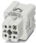
Contact insert, number of positions: 3+PE, size: D7, number of connections per position: 1, Socket, Push-in connection, 230/400 V, 10 A, 0.14 mm 2 ... 1.5 mm 2

Contact insert - HC-A03-I-PT-F - 1585265