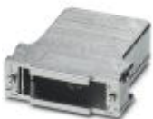
D-SUB sleeve housings, degree of protection: IP20, material: ABS, metal-plated, cable outlet: straight, size of housing: 3, color: Bare metallic

D-SUB sleeve housings - CUC-DST-GPME-S/DSSC25 - 1419719