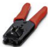
Crimp tool, pliers with die, for RJ45 pin inserts VS-08-ST-H...-RJ45 and VS-08-RJ45-10G/C

Crimping pliers - VS-CT-RJ45-H - 1653265