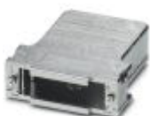
D-SUB sleeve housings, degree of protection: IP20, material: ABS, metal-plated, cable outlet: straight, size of housing: 3, color: Bare metallic

D-SUB sleeve housings - CUC-DST-GPME-S/DSSC25 - 1419719