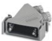
D-SUB sleeve housing, shell size 3, IP67 degree of protection

D-SUB sleeve housings - VS-25-T-2M20 - 1689792