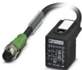
Sensor/actuator cable, 3-position, PUR, black-gray RAL 7021, Plug straight M12, on Valve connector BI (11 mm), cable length: 3 m

Please be informed that the data shown in this PDF Document is generated from our Online Catalog. Please find the complete data in the user's documentation. Our General Terms of Use for Downloads are valid ( http://phoenixcontact.com/download )