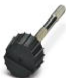
Fillister head screw with plastic knurl, M3 x 40

Screw - SAC-V-SCREW-M3-29 KNURL - 1403779