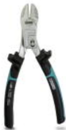
Power diagonal cutter, 200 mm, induction-hardened cutting, VDE 1000 V AC/ 1500 V DC tested

Please be informed that the data shown in this PDF Document is generated from our Online Catalog. Please find the complete data in the user's documentation. Our General Terms of Use for Downloads are valid ( http://phoenixcontact.com/download )