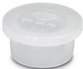
Protective cap made of transparent plastic for QPD QUICKON connection 4x 2.5 mm 2 , IP50.

Please be informed that the data shown in this PDF Document is generated from our Online Catalog. Please find the complete data in the user's documentation. Our General Terms of Use for Downloads are valid ( http://phoenixcontact.com/download )