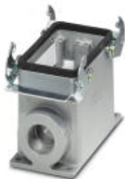
HEAVYCON box mounting base, D50, with double locking latch, height: 81 mm, with 1 x M32 support

Please be informed that the data shown in this PDF Document is generated from our Online Catalog. Please find the complete data in the user's documentation. Our General Terms of Use for Downloads are valid ( http://phoenixcontact.com/download )