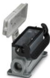
HEAVYCON box mounting base B24, with single locking latch, height 67 mm, with support 1x M25 and cover

Please be informed that the data shown in this PDF Document is generated from our Online Catalog. Please find the complete data in the user's documentation. Our General Terms of Use for Downloads are valid ( http://phoenixcontact.com/download )