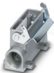
HEAVYCON box mounting base D25, with single locking latch, height 57 mm, with supports 1x M25

Please be informed that the data shown in this PDF Document is generated from our Online Catalog. Please find the complete data in the user's documentation. Our General Terms of Use for Downloads are valid ( http://phoenixcontact.com/download )