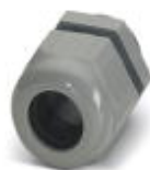
Cable gland, cable gland material: PA, external cable diameter 11 mm ... 17 mm, shielding: no, connecting thread: M25 x 1.5, color: silver-gray RAL 7001

Cable gland - G-INS-M25-M68N-PNES-GY - 1411126