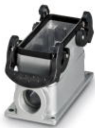
HEAVYCON box mounting base B24, with double locking latch, height 67 mm, with support 1xM25

Please be informed that the data shown in this PDF Document is generated from our Online Catalog. Please find the complete data in the user's documentation. Our General Terms of Use for Downloads are valid ( http://phoenixcontact.com/download )