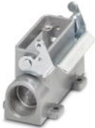
HEAVYCON box mounting base D 15, with single locking latch, height 52 mm, with support 2x M20

Please be informed that the data shown in this PDF Document is generated from our Online Catalog. Please find the complete data in the user's documentation. Our General Terms of Use for Downloads are valid ( http://phoenixcontact.com/download )