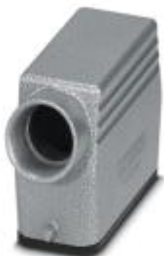
HEAVYCON sleeve housing D15, for single locking latch, height 53 mm, with support 1x M20, lateral conductor exit

Please be informed that the data shown in this PDF Document is generated from our Online Catalog. Please find the complete data in the user's documentation. Our General Terms of Use for Downloads are valid ( http://phoenixcontact.com/download )