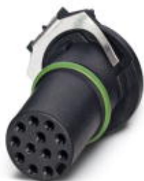
Sensor/actuator flush-type socket, 12-pos. with shroud, A-coded, with straight THR solder connection, contact insert only

Please be informed that the data shown in this PDF Document is generated from our Online Catalog. Please find the complete data in the user's documentation. Our General Terms of Use for Downloads are valid ( http://phoenixcontact.com/download )