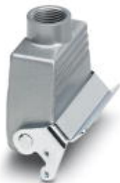
HEAVYCON coupling housing D15, with single locking latch, height 48 mm, with support 1xM20

Please be informed that the data shown in this PDF Document is generated from our Online Catalog. Please find the complete data in the user's documentation. Our General Terms of Use for Downloads are valid ( http://phoenixcontact.com/download )