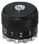
Locator for CRIMPFOX-TC MP

Spare locator - CRIMPFOX-TC MP LOC - 1045123