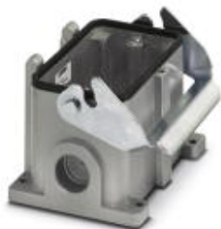
HEAVYCON box mounting base B48, with single locking latch, height 100 mm, with supports 2xM40

Please be informed that the data shown in this PDF Document is generated from our Online Catalog. Please find the complete data in the user's documentation. Our General Terms of Use for Downloads are valid ( http://phoenixcontact.com/download )