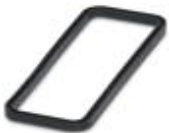
Replacement profile gasket for HC-D25 sleeve housing