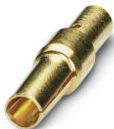
Crimp contact, turned, Single contact, contact diameter: 1 mm, crimp range: 0.5 mm 2 ... 1 mm 2

Please be informed that the data shown in this PDF Document is generated from our Online Catalog. Please find the complete data in the user's documentation. Our General Terms of Use for Downloads are valid ( http://phoenixcontact.com/download )