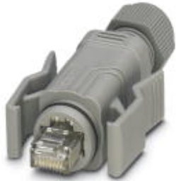
RJ45 connector, IP67, CAT5e, 8-pos., with QUICKON fast connection technology, for 1-wire and 7-wire conductors AWG 26 ... 23, for cable diameter of 5.0 mm ... 8.0 mm, TIA 568 A labeling, color: gray

Please be informed that the data shown in this PDF Document is generated from our Online Catalog. Please find the complete data in the user's documentation. Our General Terms of Use for Downloads are valid ( http://phoenixcontact.com/download )