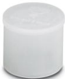
Protective cap made of transparent plastic for QPD connectors 4x 2.5 mm 2 , IP50.

Please be informed that the data shown in this PDF Document is generated from our Online Catalog. Please find the complete data in the user's documentation. Our General Terms of Use for Downloads are valid ( http://phoenixcontact.com/download )