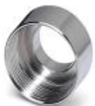
Step-up adapter, M20 to M25, including O-ring

Extension adapter - ENLAR-M-KV-M20/M25 - 1647666