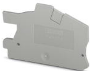
End cover, length: 66 mm, width: 2.2 mm, height: 42.3 mm, color: gray

Please be informed that the data shown in this PDF Document is generated from our Online Catalog. Please find the complete data in the user's documentation. Our General Terms of Use for Downloads are valid ( http://phoenixcontact.com/download )