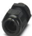
Cable gland, cable gland material: PA, external cable diameter 6 mm ... 12 mm, shielding: no, connecting thread: M20 x 1.5, color: jet black RAL 9005

Cable gland - G-INS-M20-S68N-PNES-BK - 1411133