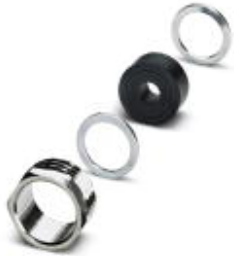
Cable gland, shielded: no, cable diameter range: 8 mm ... 12 mm

Please be informed that the data shown in this PDF Document is generated from our Online Catalog. Please find the complete data in the user's documentation. Our General Terms of Use for Downloads are valid ( http://phoenixcontact.com/download )