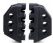
Spare die for CRIMPFOX-SC 6

Replacement die - CRIMPFOX-SC 6/DIE - 1212051