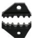
Spare die for CRIMPFOX-FO 5,41

Replacement die - CRIMPFOX-FO 5,41/DIE - 1212294