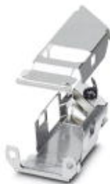
D-SUB EMC inner sleeve, for sleeve housing VS-09-..., shell size 1, shielded

Please be informed that the data shown in this PDF Document is generated from our Online Catalog. Please find the complete data in the user's documentation. Our General Terms of Use for Downloads are valid ( http://phoenixcontact.com/download )