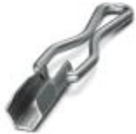
Allen wrench, for loosening and fastening the QUICKON union nut, WAF 22 mm