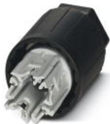
QUICKON nut, black, 4+PE-pos., 1.0 mm 2 ... 2.5 mm 2 /690 V/20 A, for cables with 6 mm ... 11 mm diameter.

Please be informed that the data shown in this PDF Document is generated from our Online Catalog. Please find the complete data in the user's documentation. Our General Terms of Use for Downloads are valid ( http://phoenixcontact.com/download )