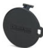
Protective cap for 3 and 5-pos. PRC field plugs