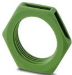
Circular connectors (device-side), Nut, color: green

Please be informed that the data shown in this PDF Document is generated from our Online Catalog. Please find the complete data in the user's documentation. Our General Terms of Use for Downloads are valid ( http://phoenixcontact.com/download )