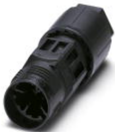
QUICKON cable connector, black, 4+PE-pos., 1.0 mm 2 ... 2.5 mm 2 / 690 V / 20 A, for 6 mm ... 11 mm cable diameter.

Please be informed that the data shown in this PDF Document is generated from our Online Catalog. Please find the complete data in the user's documentation. Our General Terms of Use for Downloads are valid ( http://phoenixcontact.com/download )