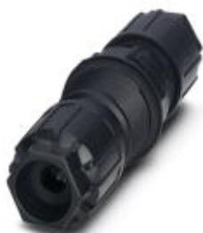
Cable connector panel feed-through, two-sided with QPD nut, black, 3+ PE pos., 1.0 mm 2 ... 2.5 mm 2 /630 V/20 A, for cable diameters of 9 mm ... 14 mm.

Please be informed that the data shown in this PDF Document is generated from our Online Catalog. Please find the complete data in the user's documentation. Our General Terms of Use for Downloads are valid ( http://phoenixcontact.com/download )