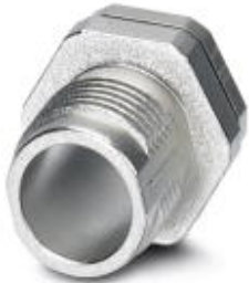
Housing screw connection with M12 standard thread, with O-ring, for the two-piece straight M12 THR contact carrier and for the two-piece angled M12 contact carrier

Please be informed that the data shown in this PDF Document is generated from our Online Catalog. Please find the complete data in the user's documentation. Our General Terms of Use for Downloads are valid ( http://phoenixcontact.com/download )