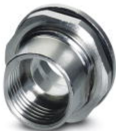
Housing screw connection with M12 standard thread, with O-ring, for 2-piece K, L, and M-coded THR contact carriers

Please be informed that the data shown in this PDF Document is generated from our Online Catalog. Please find the complete data in the user's documentation. Our General Terms of Use for Downloads are valid ( http://phoenixcontact.com/download )