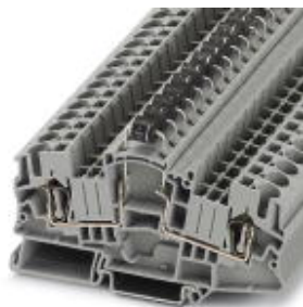
Component terminal block, with integrated P1000Y diode, connection method: Spring-cage connection, cross section: 0.2 mm 2 - 10 mm 2 , AWG: 24 - 10, width: 8.2 mm, color: gray

Please be informed that the data shown in this PDF Document is generated from our Online Catalog. Please find the complete data in the user's documentation. Our General Terms of Use for Downloads are valid ( http://phoenixcontact.com/download )