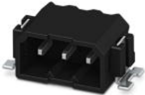
The figure shows the 3-pos. version

PCB headers, nominal current: 6 A, rated voltage (III/2): 160 V, number of positions: 5, pitch: 2.5 mm, color: black, contact surface: Tin, mounting: SMD soldering