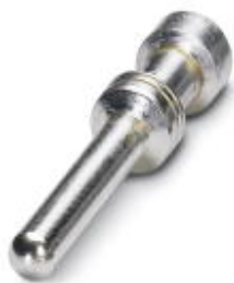
Turned 2.5 crimp contact, individual male contact, core diameter 4.00 mm 2 , silver-plated

Please be informed that the data shown in this PDF Document is generated from our Online Catalog. Please find the complete data in the user's documentation. Our General Terms of Use for Downloads are valid ( http://phoenixcontact.com/download )