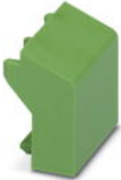
Filler plugs, for unoccupied terminal points

Please be informed that the data shown in this PDF Document is generated from our Online Catalog. Please find the complete data in the user's documentation. Our General Terms of Use for Downloads are valid ( http://phoenixcontact.com/download )