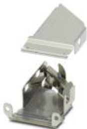
D-SUB EMC inner sleeve, shell size 2, shielded, for sleeve housing VS-15-...

Please be informed that the data shown in this PDF Document is generated from our Online Catalog. Please find the complete data in the user's documentation. Our General Terms of Use for Downloads are valid ( http://phoenixcontact.com/download )