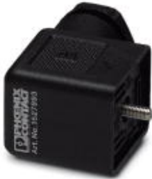
Valve connectors, 3-position, Valve connector BI (11 mm), Screw connection, cable gland Pg9, external cable diameter 6 mm ... 8 mm

Please be informed that the data shown in this PDF Document is generated from our Online Catalog. Please find the complete data in the user's documentation. Our General Terms of Use for Downloads are valid ( http://phoenixcontact.com/download )