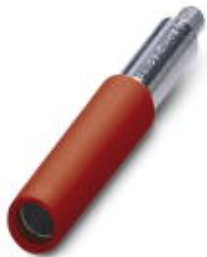
Female test connector, color: red

Please be informed that the data shown in this PDF Document is generated from our Online Catalog. Please find the complete data in the user's documentation. Our General Terms of Use for Downloads are valid ( http://phoenixcontact.com/download )